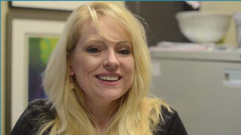
Oregon Attorney General Sexual Assault Task Force